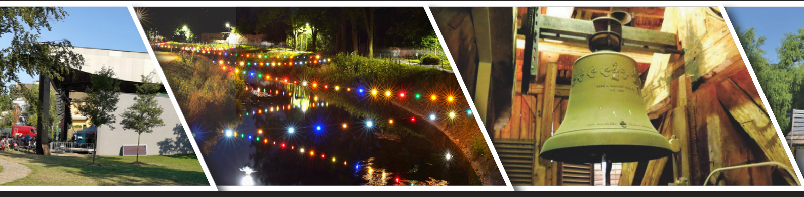
Vydalo město Hronov ve spolupráci s Kulturním a informačním střediskem Hronov | Fotografie v publikaci jsou ve vlastnictví Kladské pomezí, o. p. s. a Kulturního a informačního střediska Hronov